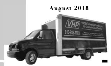
"Wherever you see a 'Vincent's Van Go' you know the job will be a work of art."